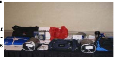
Donated Items for Raffle Drawings

Congrats to all winners from raffle drawing winners over the past year!